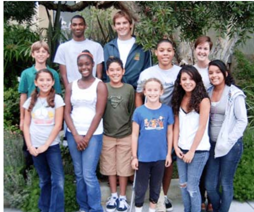
2008 YOUTH MANAGER CLASS

It continues to be one of very few nonprofits run by kids with support of adult partners. Our third generation of young executives is now training the fourth. It all begins with LEAD.